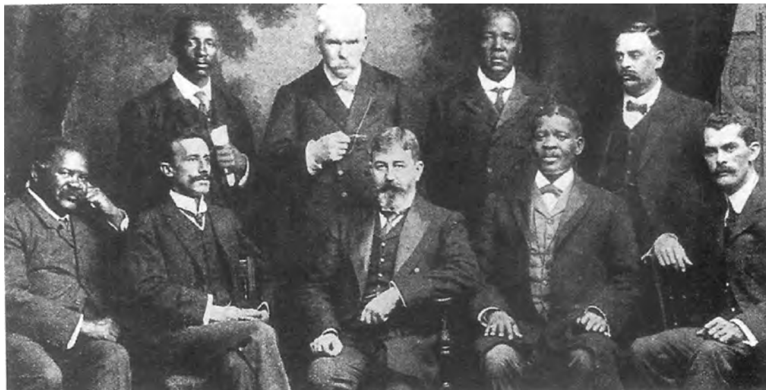
A photograph showing a South African deputation to Britain, 1909. The deputation was seeking full democratic rights for all South Africans.

17 Look at the photograph, and then answer the questions which follow.