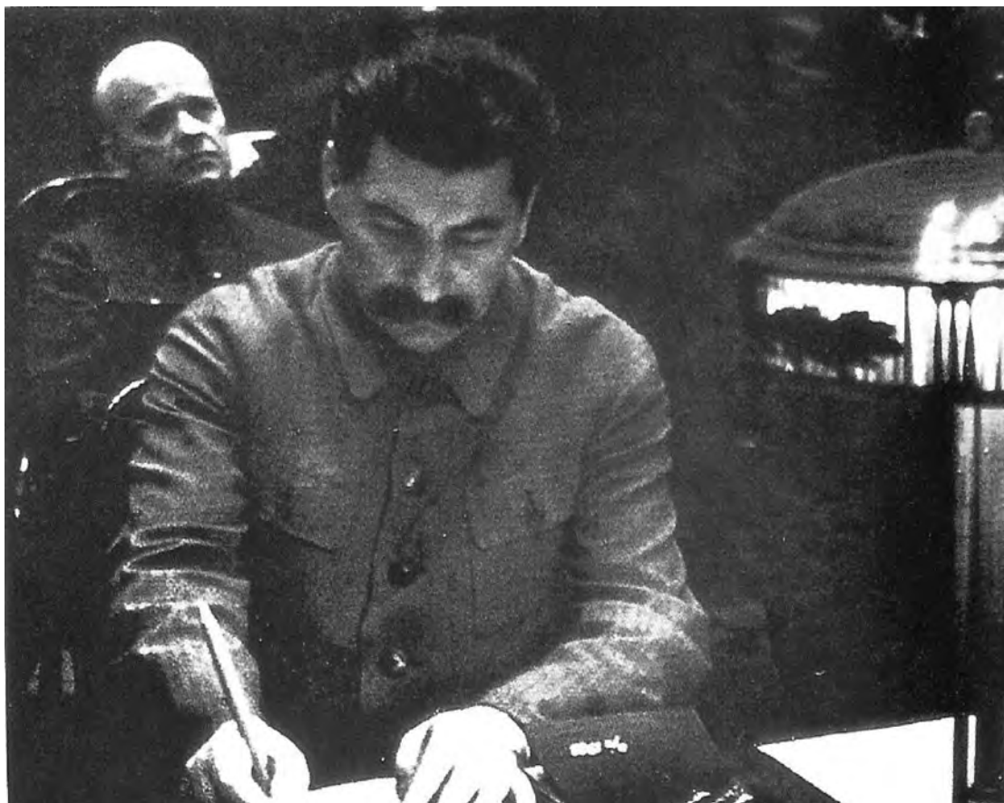
A photograph of Stalin signing death warrants. It was taken in the 1930s.

12 Look at the photograph, and then answer the questions which follow.