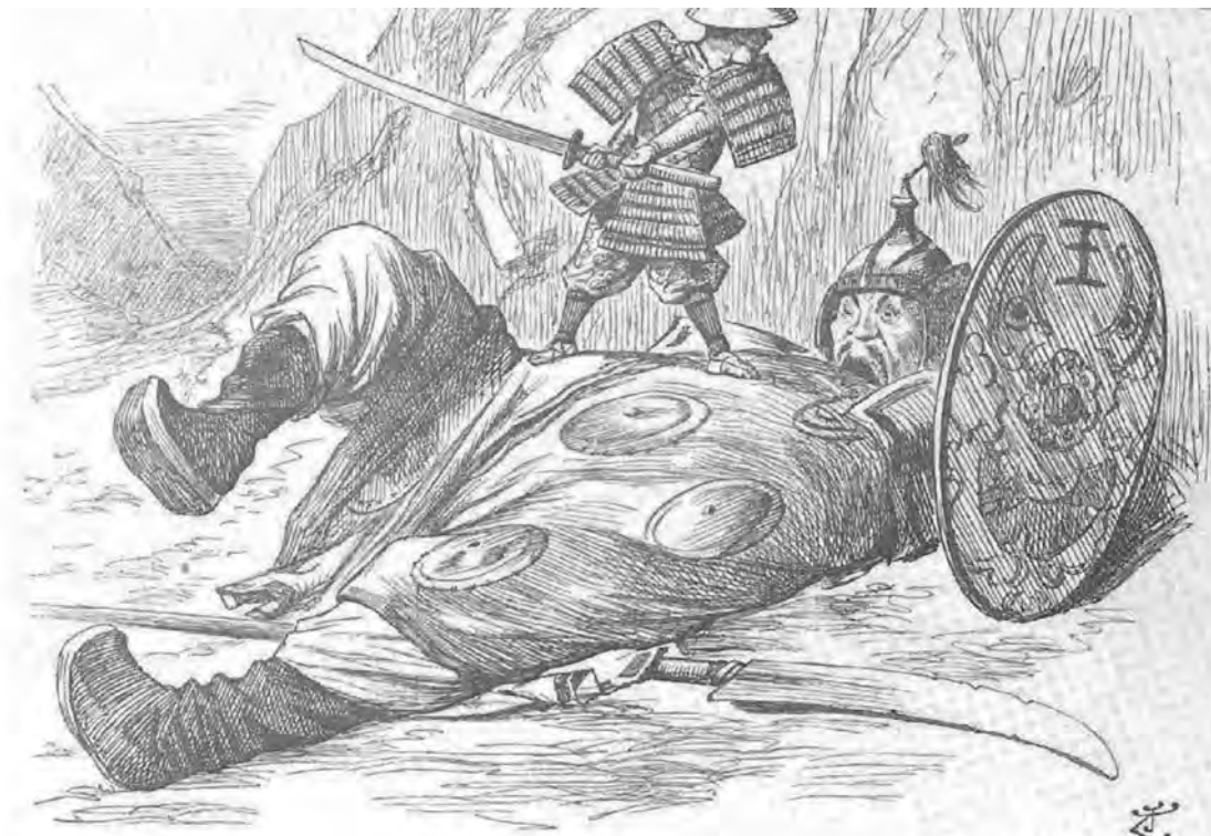
An illustration referring to the Japanese victory over China in 1895.