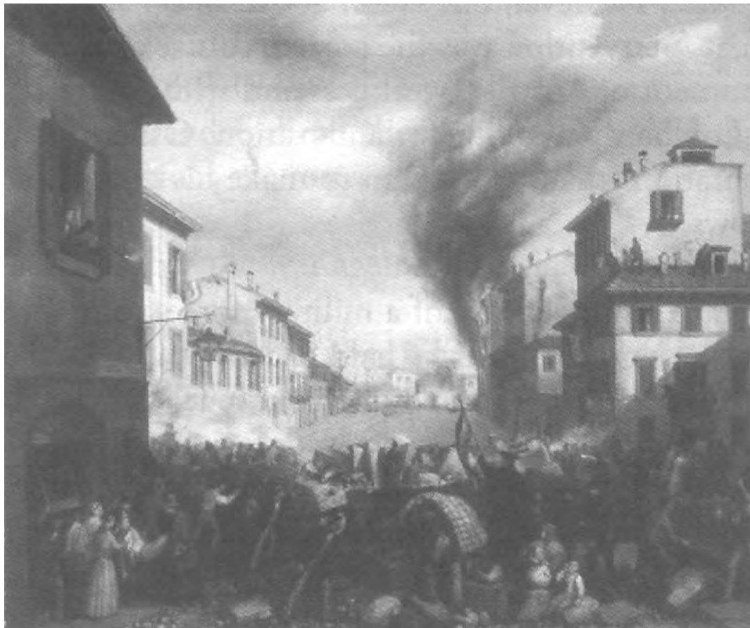
A street battle during the Milan uprising, March 1848.