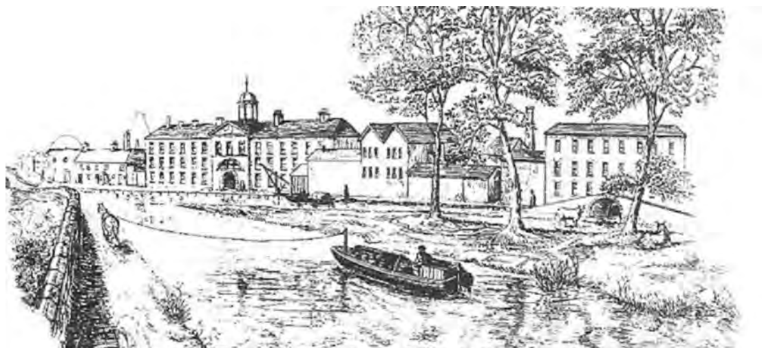
An illustration of Wedgwood's pottery works at Etruria on the banks of the Trent and Mersey Canal, c.1900.

23 Look at the illustration, and then answer the questions which follow.